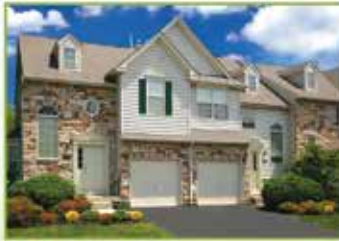
Heritage Summer Hill Signature Drive, Doylestown, PA 18902