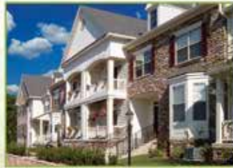
Heritage Greene 807 Ridgeview Court, Sellersville, PA 18960