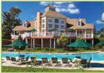
Heritage Orchard Hill - Clubhouse 1 Applewood Drive, Perkasie, PA 18944