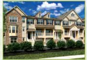
Heritage Pointe Village Way, Chalfont, PA 18914