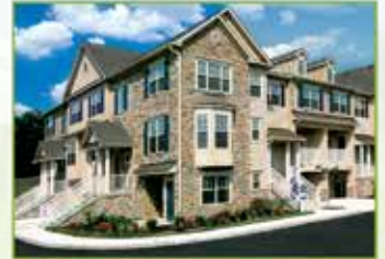
Heritage Pointe Village Way, Chalfont, PA 18914

HERITAGE Property Management *Features/amenities available at most communities