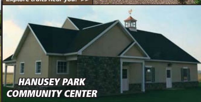
HANUSEY PARK COMMUNITY CENTER