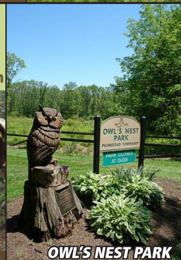
OWL'S NEST PARK