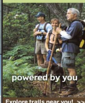
powered by you