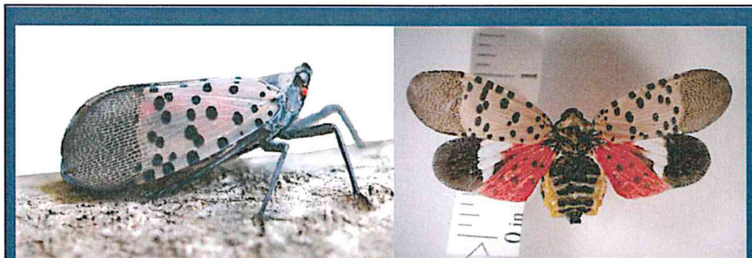
Adult Spotted Lanternfly, present in autumn months.

If you find any of these life stages of the Spotted Lanternfly, remove, devitalize, place in a sealed bag, and dispose of bag in the garbage.